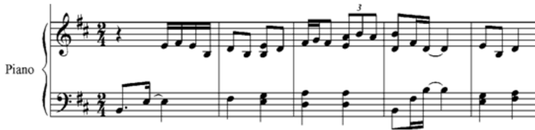
Excerpt 4: Piano introduction of the 2 nd movement

The violin pronounces at this point in picking up a double-stopping in the same key and shifts to G anhemitonic pentatonic (measures 6-13) shifting the tonal centre from D anhemitonic to G anhemitonic pentatonic. The third movement of Xylafrique was scored for the full orchestra introducing Dagaaba traditional instruments such as Nukpola , Kuor , Velkepele , Gangaar , Chiamε and the Gyil . The gyil , like the French horn, transposes a 5 th above and therefore plays G when all concert instruments are playing in C.