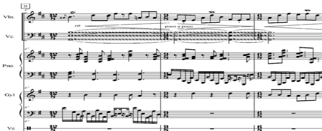
Excerpt 5: A derivation of Leonardo Fibonacci sequence in Xylafrique

Furthermore, an adaptation of the Fibonacci sequence was also used from measures 47 to bar 53. A true Fibonacci sequence is a series of numbers that read 1,1,2,3,5,8,13,21,34,55,89.... etc. Each number, after the second, is the sum of the two previous numbers. This sequence was discovered by the Italian mathematician Leonardo Fibonacci (Kramer 1973, p.110).